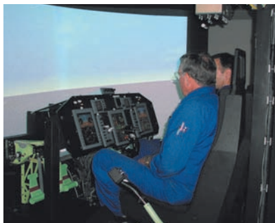
Bell's HIL test rig includes three flight control computers, electrohydraulic actuators, and equipment for applying simulated loads to the actuators.

Pilots “fly” by viewing simulated displays and operating real controls, including real stick and force-feel systems. Stick movements send fly-by-wire signals to the FCCs to move the actuators. The simulator then computes airframe aerodynam-