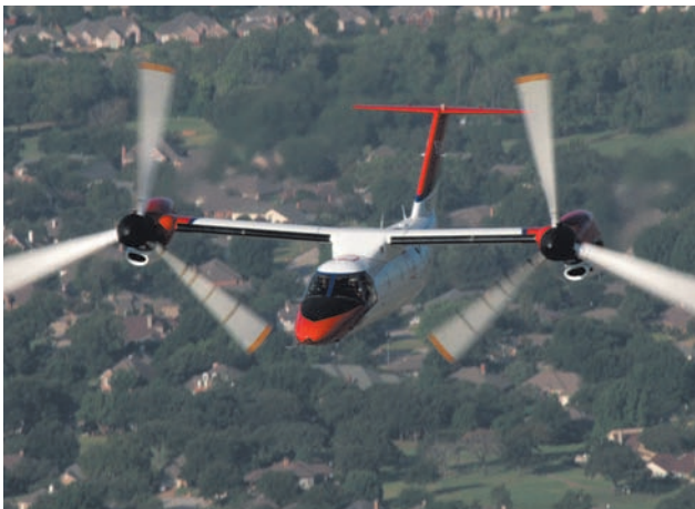
The BA609 flying in airplane mode.

Could they build in sufficient redundancy to satisfy stringent safety and flight requirements? Could they keep the empty weight low enough to satisfy the range needed to reach remote oil platforms in the North Sea and Gulf of Mexico? Could a civilian tiltrotor provide a cabin quiet and smooth enough for executive transport?