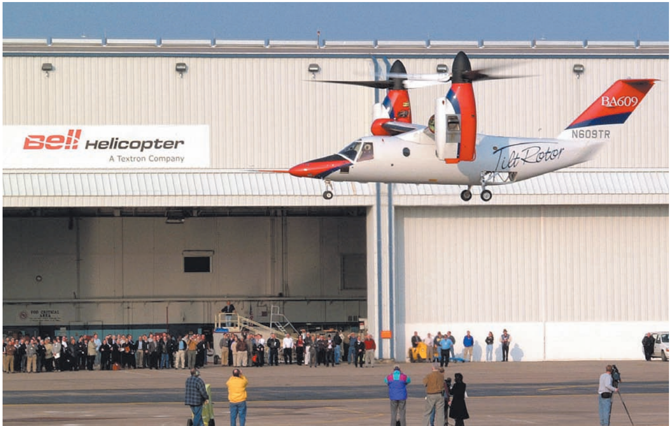
The BA609's first take-off.

model of the BA609. The “iron bird” enables test engineers to evaluate the real-time capabilities of the FCS. Just as importantly, the HIL test rig lets pilots work with the actual controls and interact with all the key flight systems from the cockpit.